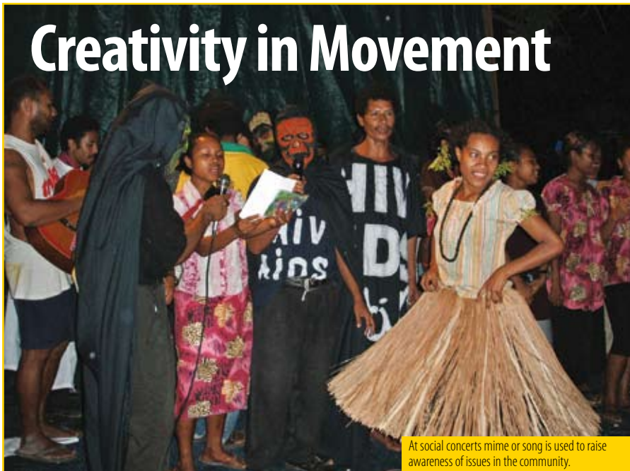
At social concerts mime or song is used to raise awareness of issues in the community.